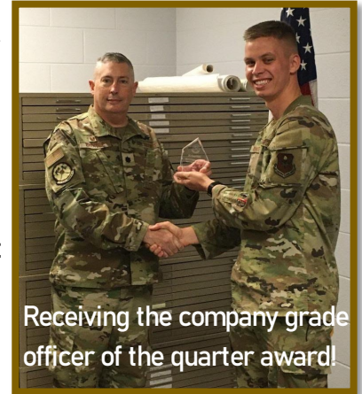
Receiving the company grade officer of the quarter award!