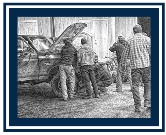
Thank you for your support and prayers!

Follow my example, as I follow the example of Christ 1 Corinthians 11:1